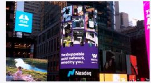
November 20, 2025 — 3:45 PM - 4:15 PM ET Nasdaq MarketSite, 4 Times Square, New York